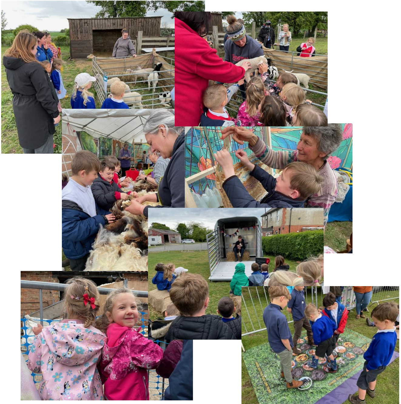
A few scenes from the 'Paddock to Plate' event.